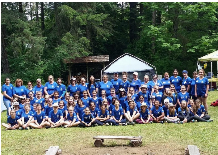
Camp Jubilee 2016

If you need information or have ideas for Provincial Camping activities, please feel free to email the BC Camping Committee ( camp@bc-girlguides.org )