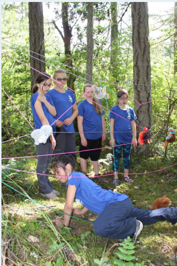
Camp Jubilee

It was really exciting to bridge with a whole bunch of Guides from all around the province this weekend. We shared a tent site with another unit and got to cook, clean and play with some other Guides for four whole days. I loved Guide Jubilee and want to do it all over again!