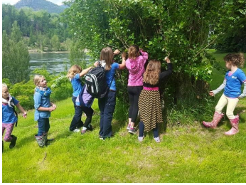
Beaver Valley Sparks and Brownies geocaching at Gyro park